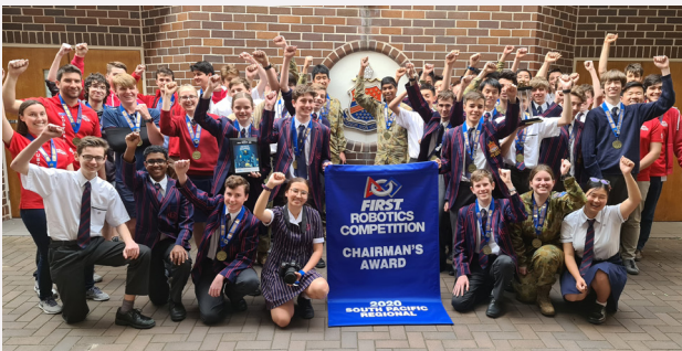
The team wins the South Pacific Chairman's Award after competing remotely online.