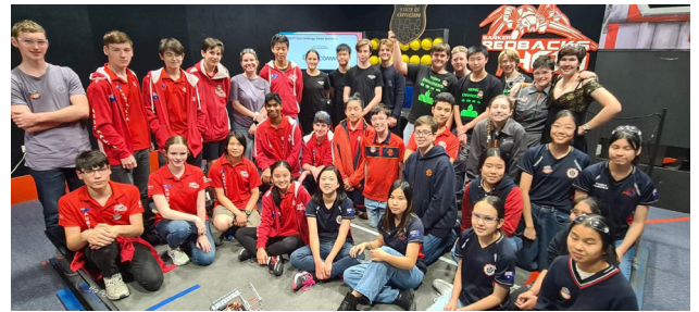
Barker hosts the inaugural FTC State of Origin Off-season competition between NSW and QLD FTC Teams.

Barker Robotics facilitates a VEX sponsorship of robotics for Dhupuma Barker, and the provision of drones to encourage inquiry and inspiration in technology.