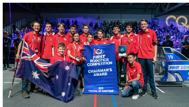
The tea wins Chairman’s Award at Quebec Regional, Canada.