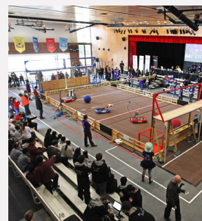
Barker hosts Dual Down Under in the MPH. Team 4613 qualifies first and wins the event. Barker hosts DDU in 2014 and 2015.