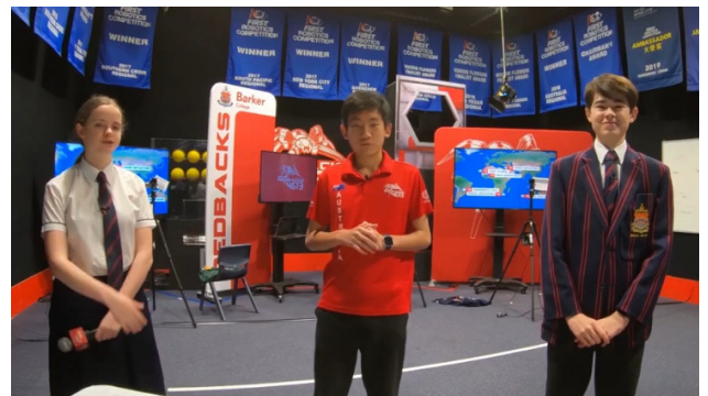
The Redbacks presents for the Chairman's Award remotely over Teams creating a 'Newsroom' presentation leveraging our experience in live event video.

The team wins The Pacific Regional, and the World Championship Chairman's Award for our work fostering robotics locally and globally, and is inducted into the FIRST Robotics Hall of Fame.