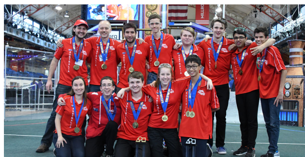
The team wins Shenzhen, Southern Cross, South Pacific and New York City Regionals and wins the Chairman's Award at NYC. The team is a finalist in the Hopper Division at World Championships and wins Innovation in Control Award for autonomous software.

Barker Implements the VEX Robotics Competition in Middle School.