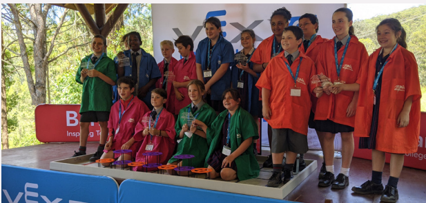
Baker Robotics partners with VEX to bring robotics to Darkinjung Barker, with weekly training sessions provided by Robotics mentors.