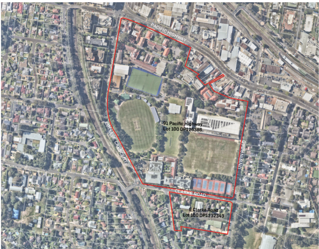
Figure 1 Barker College campus

Barker College is a co-educational Anglican School for students from Pre-Kindergarten to Year 12 with boarding from Years 10 to 12. The school was founded in 1890 in Kurrajong Heights and relocated to its current Hornsby campus, on the lands of the Dharug people, in 1895. Under the banner of "Inspiring Tomorrow", Barker continues to plan for its future to support the needs of students, staff and the surrounding local community.